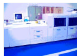
Payformance has created a state-of-the-art production center that is fully equipped and tightly secured